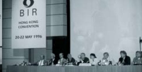
Hong Kong 1996